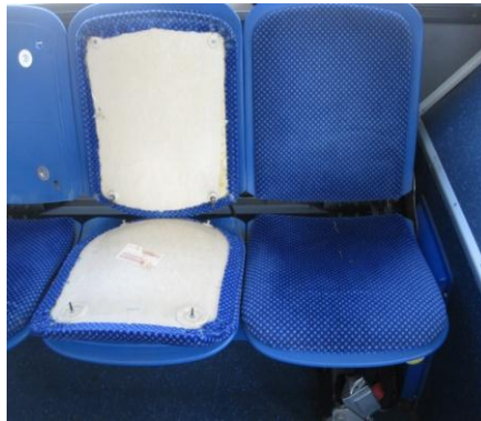
2008 Nabi 5401-5455 Wheel Chair Seat