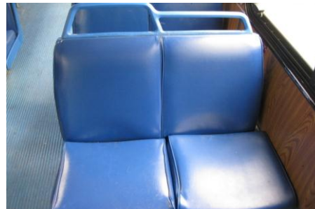
1997 Orion 5 3900-3950