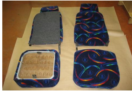
2005 Orion 7's 2701-2730