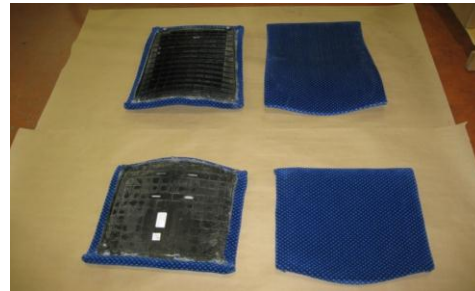
2007 New Flyer 2801-2825