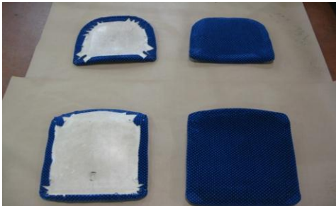
2005 Orion 7 2501-2685