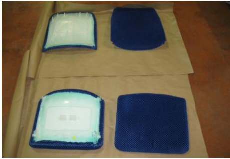
2006 New Flyer 6101-6217