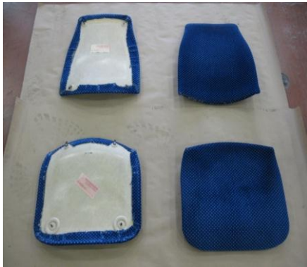
2008 Nabi/New Flyer 5401-5455